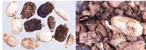
A variety of insect eggs. (on left). An ant carrying a stick insect egg (on right).

Females lay eggs one at a time, often with a flick of their abdomens to throw the egg some distance. An individual female drops eggs at a rate of one to several per day and she can produce between 100 and 1,300 eggs in her lifetime. They fall to the ground and lie in the leaf litter.