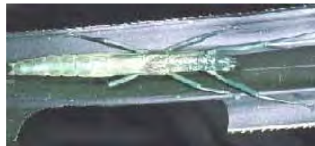
Female Peppermint Stick Insect.

Females have an average length of 10 cm. They are pale green and flat with tiny wings. By day they hide in the bases of prickly Pandanus leaves ( Pandanus tectorius ) and feed on its foliage at night. Peppermint Stick Insects have an unusual chemical defence. When disturbed they squirt a milky fluid with a strong peppermint smell from glands at the front corners of the thorax. In Australia, the species is restricted to very small areas in far north Queensland, although other Megacrania spp. are known from many Pacific islands. All feed on Pandanus.