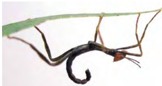
Hatching Spiny Leaf Insect resembling an ant. Image: Nicole Hoye.

Stick insect eggs are generally oval, and superficially seed-like with an amazing array of textures and ornamentation. Many also resemble tiny urns with lids, having an operculum (a cap which is pushed open to release the hatching nymph) topped with a complicated knob-like structure called the capitulum. Experiments have shown that eggs with a capitulum are attractive to ants. An egg is taken back to the ant nest, where the nutritious capitulum is eaten and the egg is discarded. This benefits the phasmids as it helps egg dispersal, plus eggs buried in ant nests have a lower rate of parasitism from wasps. Many seeds, particularly those of wattles, have a similar removable structure rich in fats (elaiosomes) that are attractive to ants. Incubation times vary enormously; some eggs hatch within a few weeks while others may remain dormant for years.