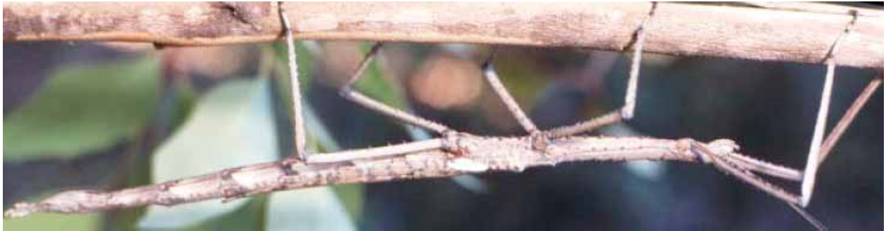
Female Titan Stick Insect.