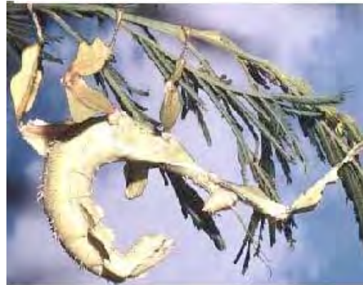
A female Spiny Leaf Insect.

feed on wattle, eucalypts and occasionally on cultivated roses.