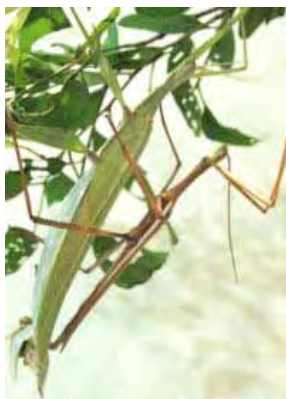
Mating pair of Children's Stick Insects.

Adult males and females are very different from each other.